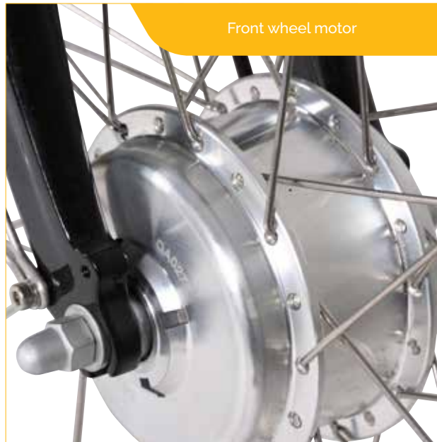
Front wheel motor