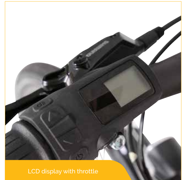
LCD display with throttle