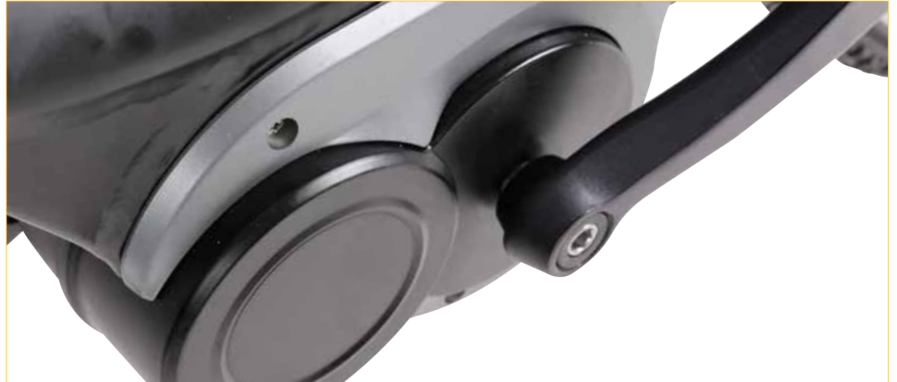
Center motor with integrated mag torque and sensor