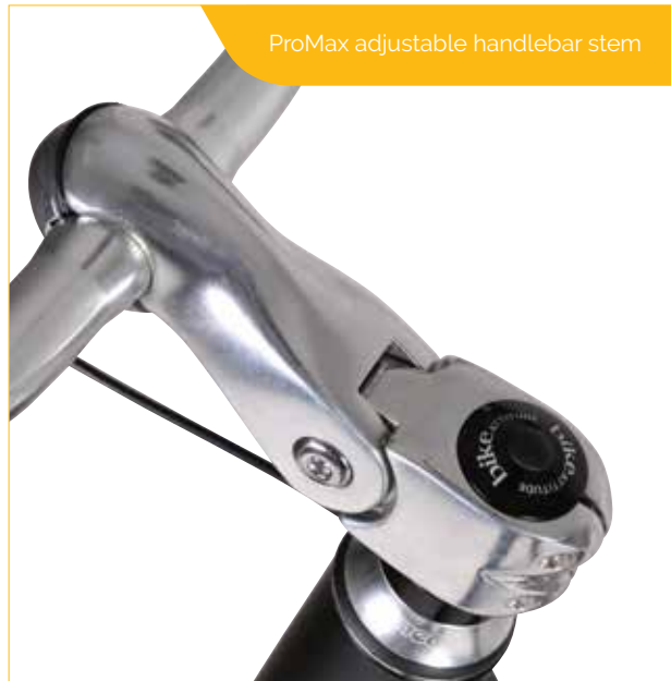
ProMax adjustable handlebar stem