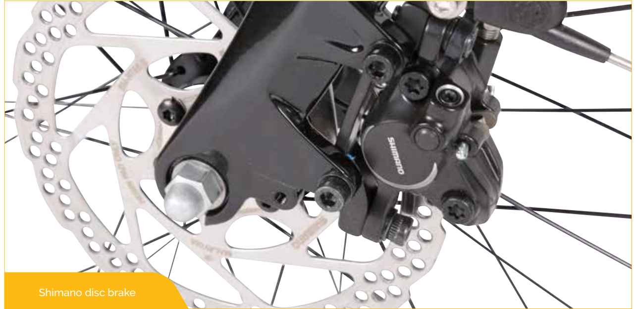
Shimano disc brake