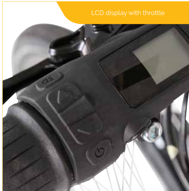
LCD display with throttle