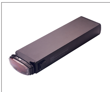
Carrier 2 battery *