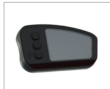
5 LED w/walk assist, light