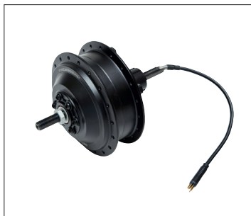
Rear motor, cassette