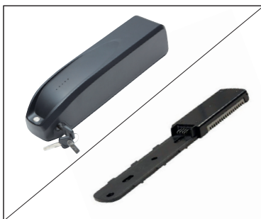
Downtube-2 battery & controller*