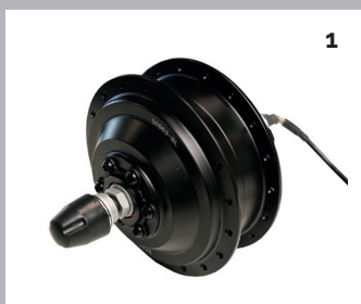
Motor w/thread (50963-BL)