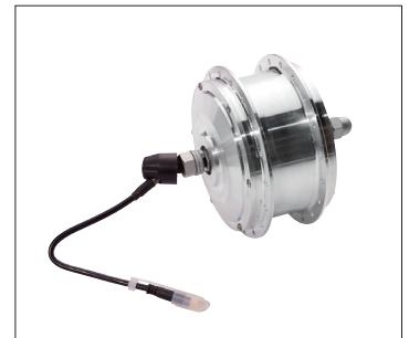
Front motor w/o free wheel