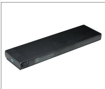
Carrier 3 battery*