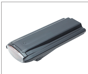
Carrier 5 battery*