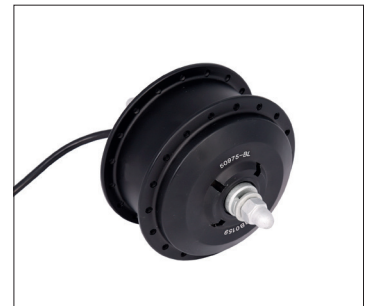
Front motor w/freewheel