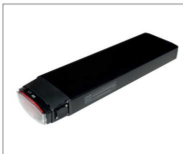
Carrier 4 battery*