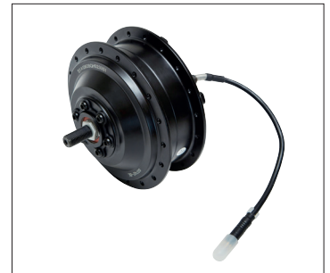
Front motor f/disc