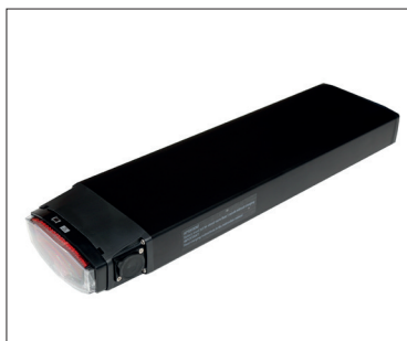
Carrier 4 battery*