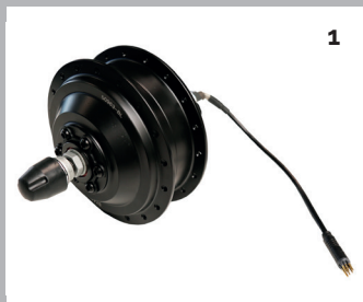
Motor w/thread (50963)