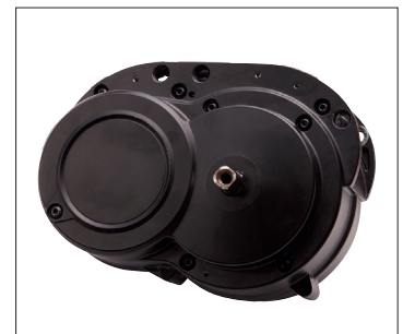
Center motor w/integrated controller, magnetic torque sensor and w/freewheel. 50378-42 standard chainwheel. 42T.