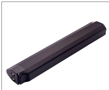
Downtube-1 battery *