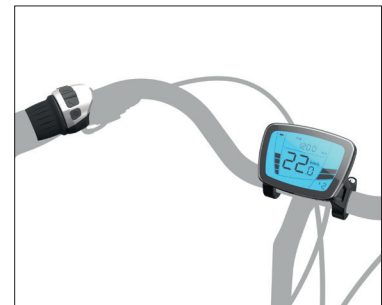
Center display w/throttle Ø22