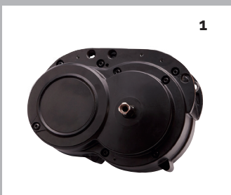
Center motor with torque sensor, w/coaster brake (50371)