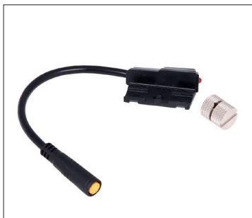
Wheel speed sensor for center motor