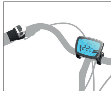
Center display w/throttle Ø22