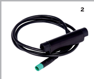
Shift sensor for centermotor / int. gear (50373)