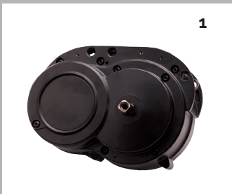
Center motor with torque sensor, f/freewheel (50361)