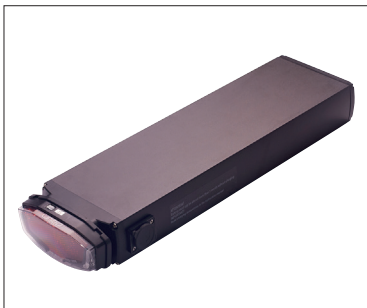
Carrier 6 battery*