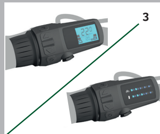
Minimal display LCD / LED (50707-2 / 50706)