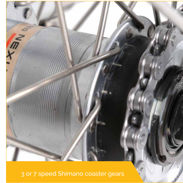
3 or 7 speed Shimano coaster gears