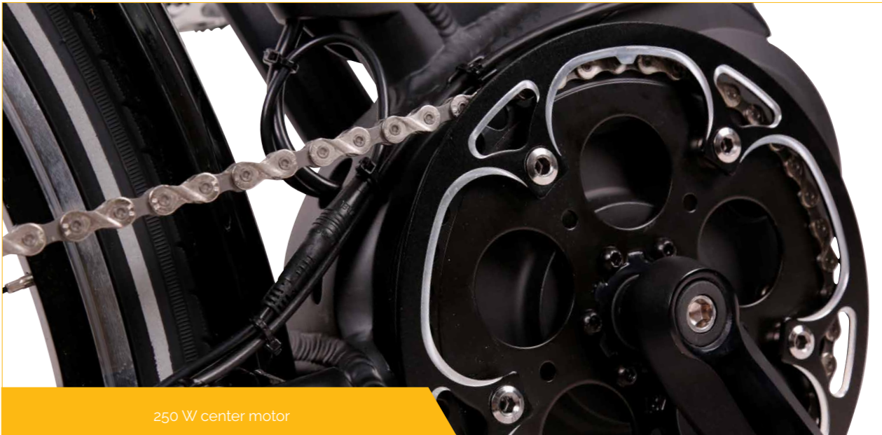
250 W center motor

All technical specifications are subject to change.