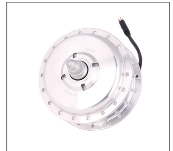
Front motor w/free wheel