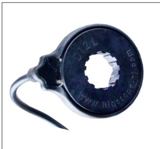
Compact speed sensor