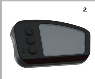
LED w/walk assist, light (50982)