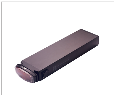
Carrier 6/2 battery*