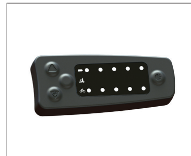
5 LED w/walk assist, light