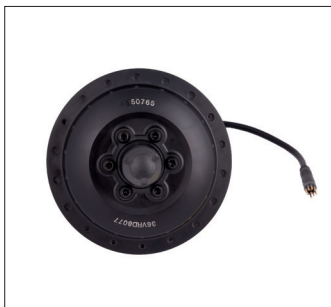
Rear motor w/free wheel, thread.