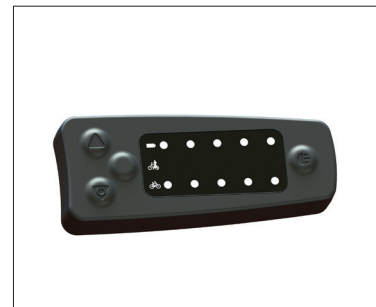
5 LED w/walk assist, light