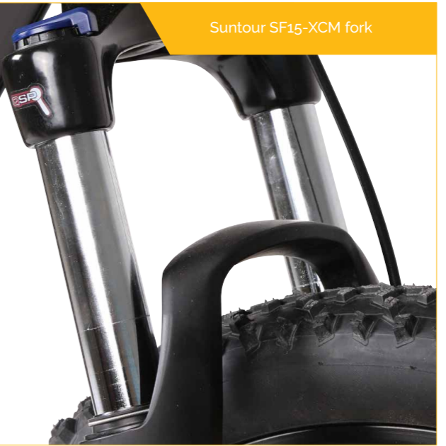
Suntour SF15-XCM fork