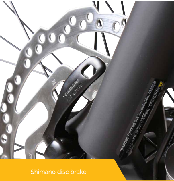
Shimano disc brake